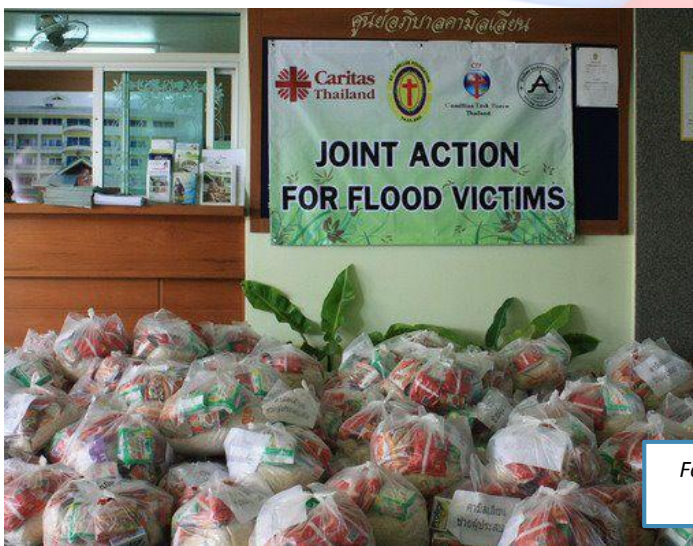
Food pax for the flood victims in Thailand

Thailand is facing the worst floods in at least 50 years. The damage swept across the country particularly along the basin of Chao Phraya River and Mekong River was the severe damage. The flooding has affected 63 provinces out of 77 provinces in Thailand, killing 384 people, missing 2 people, displacing 3,014,532 households with 9,926,471 people.