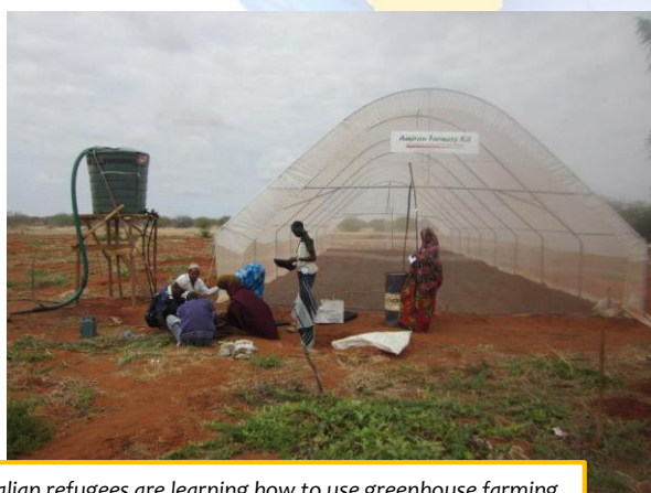
Somalian refugees are learning how to use greenhouse farming

Public Health and Sanitation Program (PHSP) is for building the people's capacity towards a better hygiene, and reduction of the Morbidity and Mortality rates. With this in mind, the CTF team gets involved in the Public Education and hygiene intervention, in the local communities and Institutions.