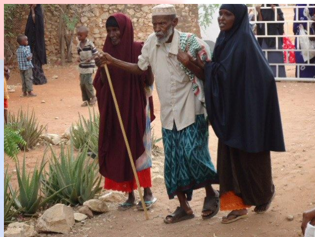
A beneficiary of the adult nutrition program is brought to the clinic.

A more comprehensive and perhaps one the CTF best practices is the ongoing project in Wajir, N. East Kenya. The key factor to its success is the full collaboration of the delegation.