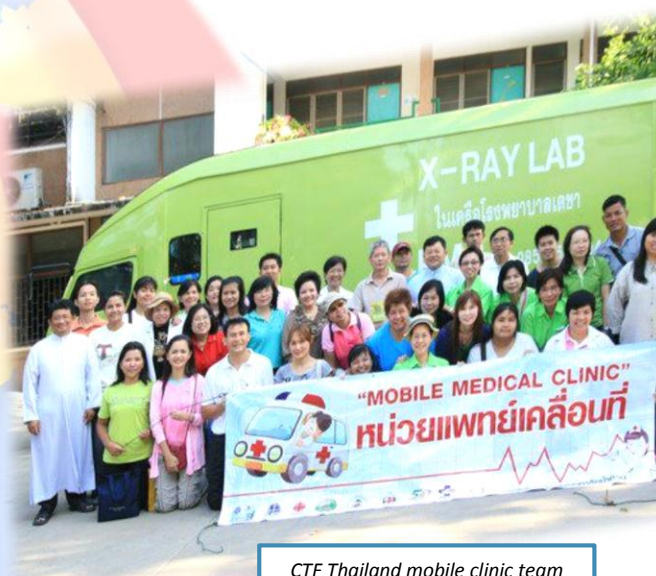
CTF Thailand mobile clinic team

This great effort was a product of a well-organized and collaborative spirit of working together as faithful and concerned citizens of Thailand. During this intervention numerous volunteers were mobilized, men and women of different faiths alike. The government through the military played a very important role in this Emergency Action Plan. The role of the local church in particular the collaboration of the parish priest was very crucial to the success of these missions.