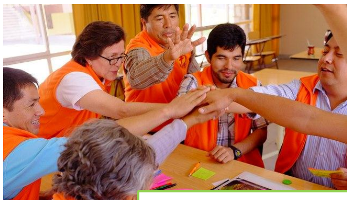
Participants of the SAS2 Workshop in Latin America

The CTF has engaged the following activities: intervention, organization, formation. Direct intervention activities in disaster areas have been organized in the countries of Philippines, Thailand, Italy, and Kenya. CTF has engaged itself in the first two phases of disaster: emergency and rehabilitation. It was able to organize a comprehensive health support, relief distribution, sanitation and hygiene, shelter and food security projects.