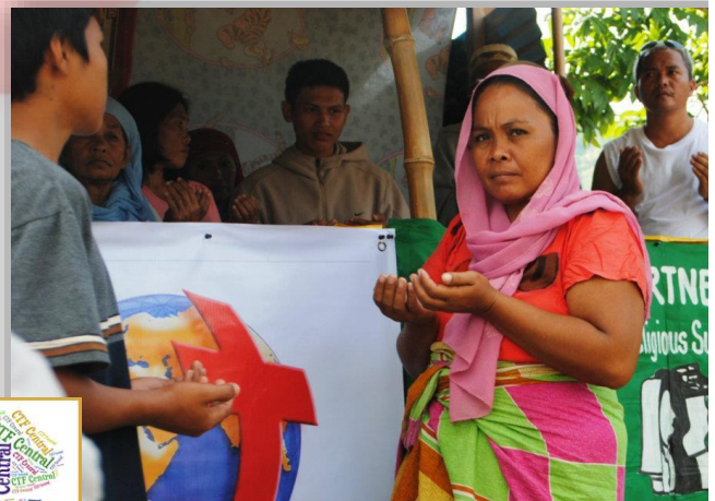
Muslim beneficiaries pray together with the Christians