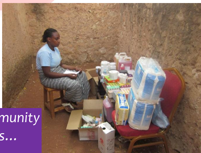
A CTF nurse prepares medicines for the mobile clinic