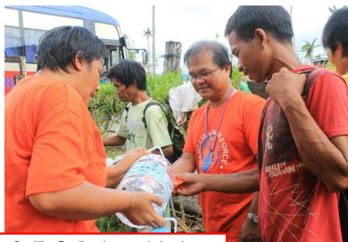
Lay Camillian Family volunteers during the relief distribution operation in Davao Oriental.

"We coordinated our services together with the local officials"