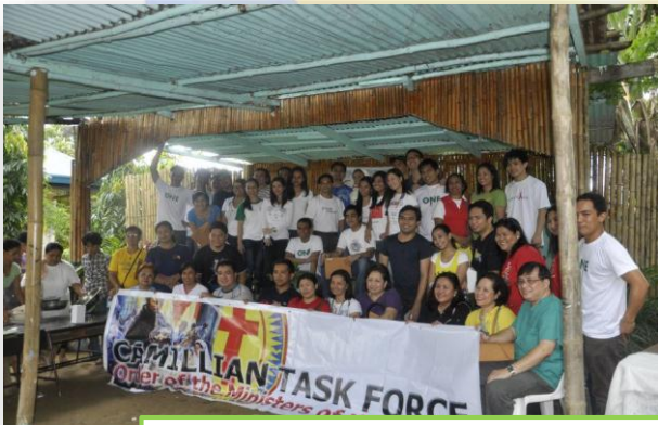
CTF Philippines medical team & volunteers