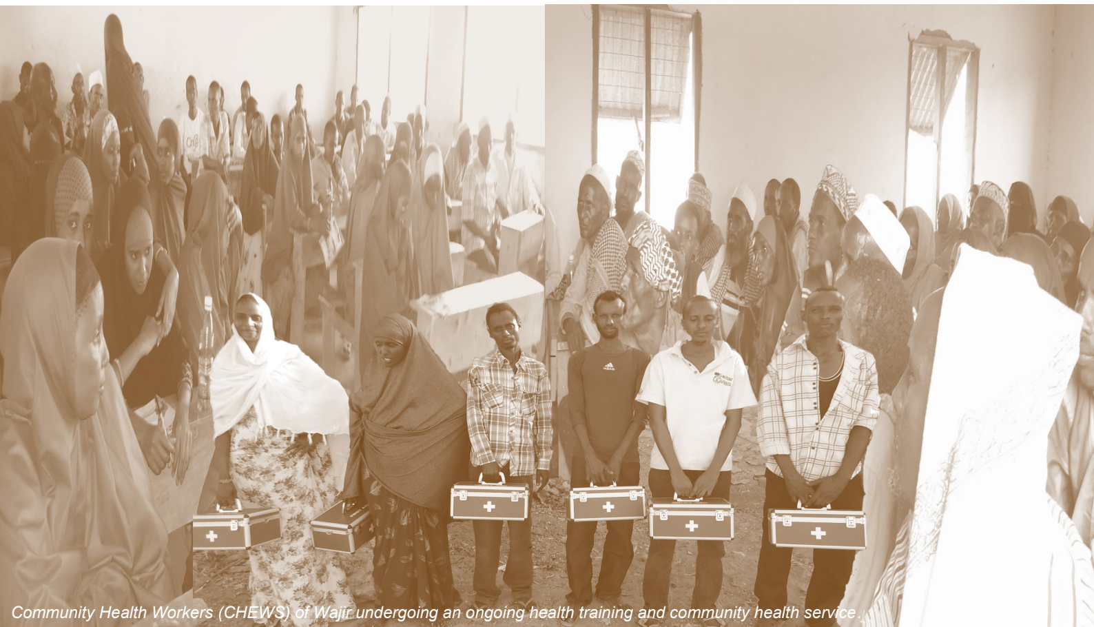
Community Health Workers (CHEWS) of Wajir undergoing an ongoing health training and community health service.