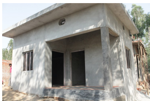
The new house is soon to be awarded in July.