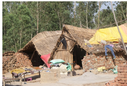
Peoples temporary shelter since June 2013.

ing their own homes. The completion and awarding of houses will be on July 2014.