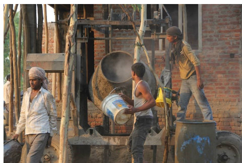
Ongoing construction of permanent shelter. Beneficiaries shared for labor.