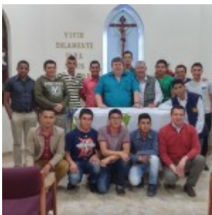
Message of the Superior General to the Delegation of Colombia-Ecuador ITALIAN SPANISH PORTUGUESE ENGLISH