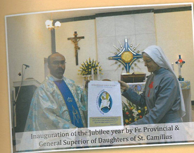
Inauguration of the Jubilee year by Fr. Provincial & General Superior of Daughters of St. Camillus