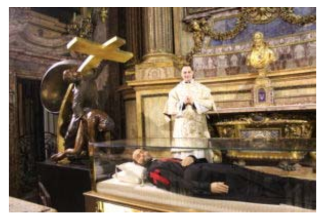
Martire (San Vincenzo La Costa CS).

Download here the invitation and the poster