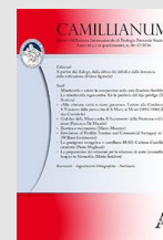
Rivista “Camillianum” (dal 1990)

Largo Ottorino Respighi 6 - 00135 Roma Tel. +39 06.3297495; Fax +39 06.3296352 segreteria@camillianum.it www.camillianum.it