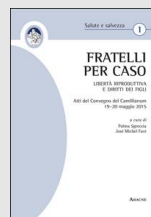
Fratelli per caso. Libertà riproduttiva e diritti dei figli (2016)