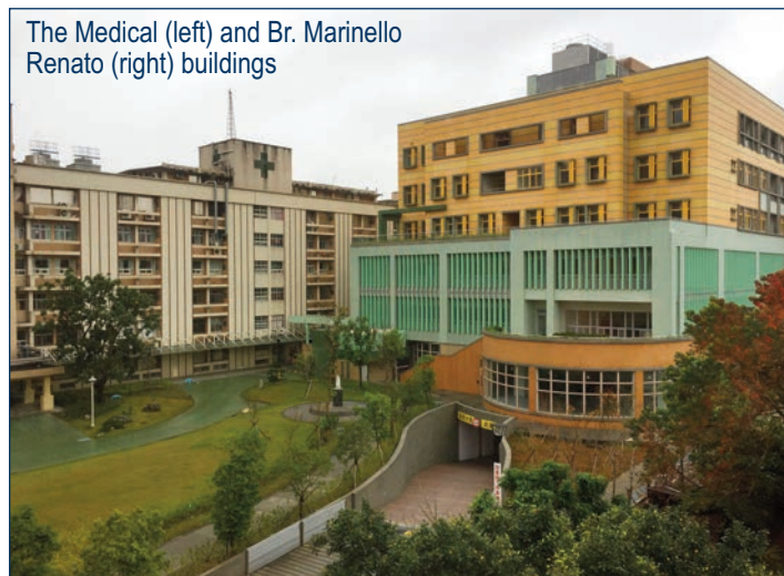
The Medical (left) and Br. Marinello Renato (right) buildings