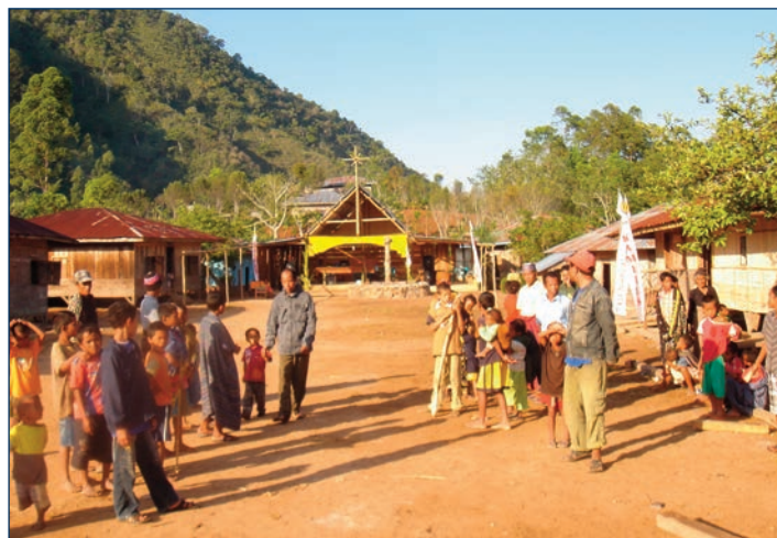
Building good relations with the villagers

Our seminarians during summer vacation have had meaningful and interesting experience in mountainous villages. There they are hosted in different families with whom they live the moments and activities of the day, sharing their food and farming in the rice field and cultivating vegetables.