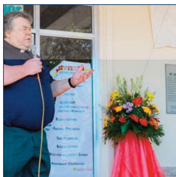
Unveiling of the commemorative marker in Mati