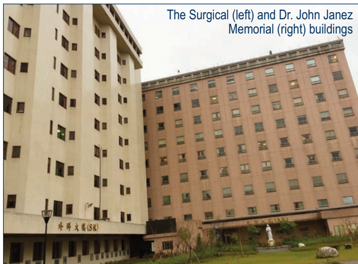
The Surgical (left) and Dr. John Janez Memorial (right) buildings

The Sacred Heart of Jesus Church is located in the compound where St. Mary's Hospital is. Mass is concelebrated daily at 6:45am. We were able to hear mass in Chinese