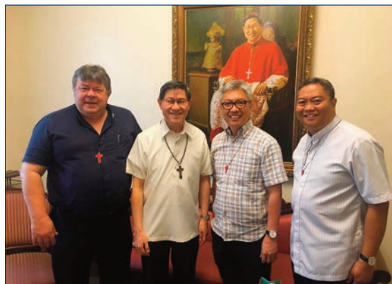
Courtesy call to His Eminence Luis Antonio Cardinal Tagle