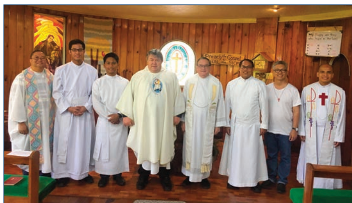
Investiture of the 3 novices at St. Camillus Novitiate in Baguio