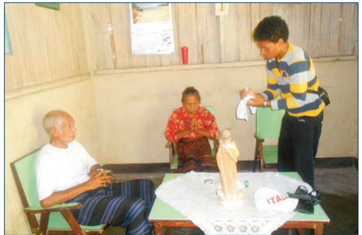
Bringing Holy Communion to the elderly

Other novices, at the same time, go to visit the old and sick in some villages of the parish. They bring Holy Communion, pray with them and listen to their painful stories.