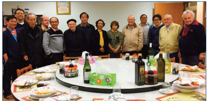
SACRED HEART OF JESUS community with CamUp