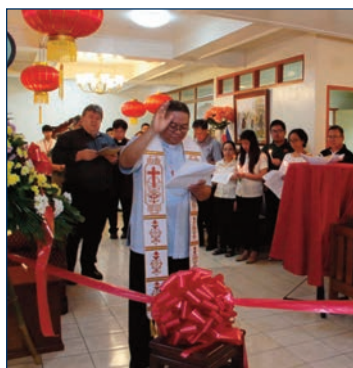
Blessing of new central offices