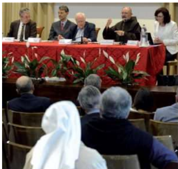
Un momento del Convegno al Camillianum di Roma