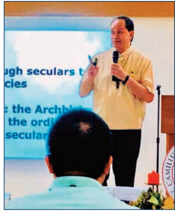
Archbishop Orlando Cardinal Quevedo, OMI, DD of the Archdiocese of Cotabato