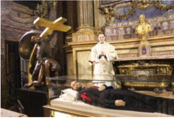
Martire (San Vincenzo La Costa CS).