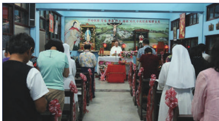
June 8, 2018: There was the solemnity of the Sacred Heart of Jesus, patron of the chapel of St. Mary's Hospital. We celebrated also a solemn Mass at the Sacred Heart of Jesus Church in Hanxi.