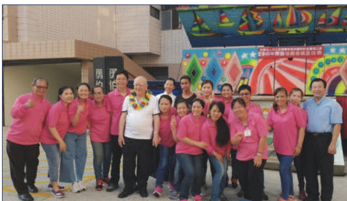
May 19, 2018: In Makung, there were celebrations for the 20th anniversary of the nursing home. Many people attended, including all the local personalities.