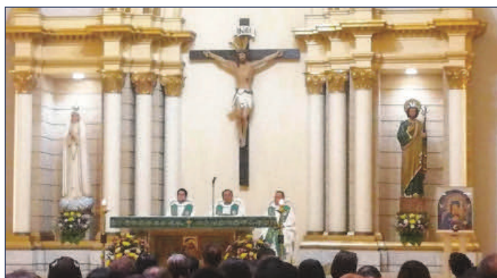
Mass for those who passed on due to the complications of HIV