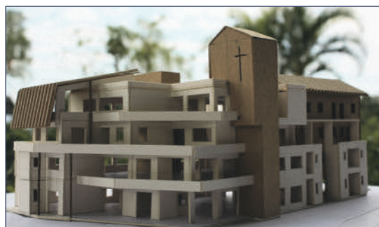
Laying of the cornerstone for the future center for people with Alzheimer's.