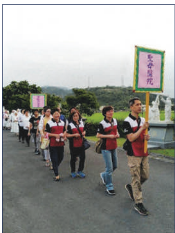
May 26, 2018: For the first time a procession was organized from the St. Camillus Church to the grotto of Lourdes in the Nursing College. More than 300 Catholics attended.