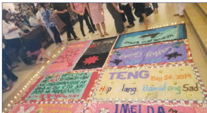
Candle lighting after the Lotus Ceremony