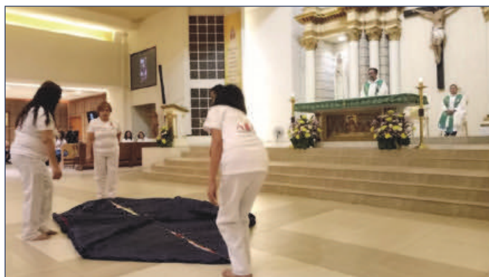
The Lotus Ceremony

Registration of attendees during the "BUGSO" at the Cinema 4 SM Megamall