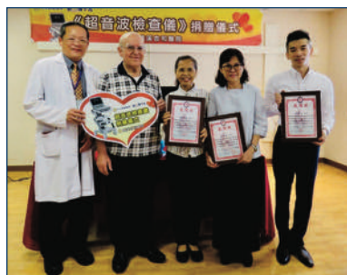
July 4: A company donated a machine at the Chiaoshi hospital as a thank you for the work done by the Camillians in remote areas.