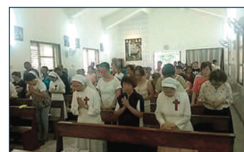
June 29: It was the 63rd anniversary of the church in Tung Hao where the Camillians had just taken over the administration.