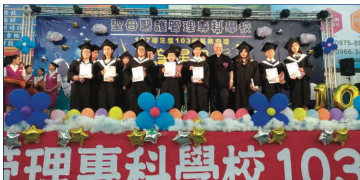
June 1: Graduation day of the Nursing College as nearly 600 students received their diplomas.