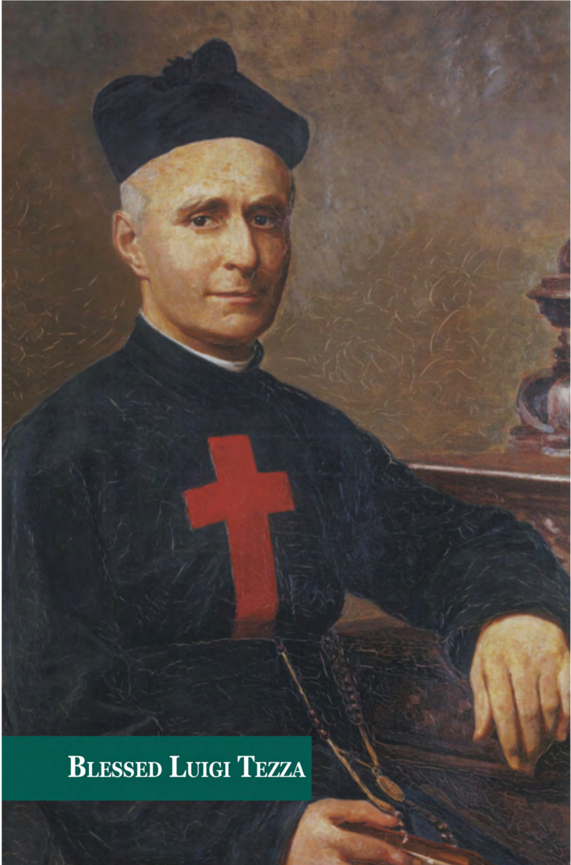
BLESSED LUIGI TEZZA