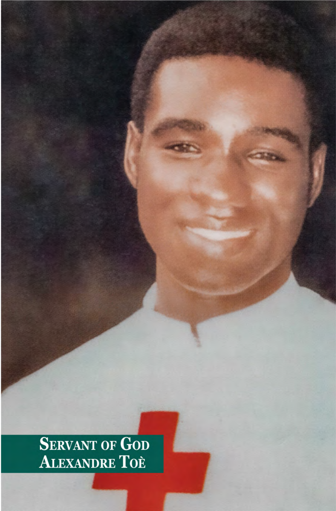
SERVANT OF GOD ALEXANDRE TOÈ