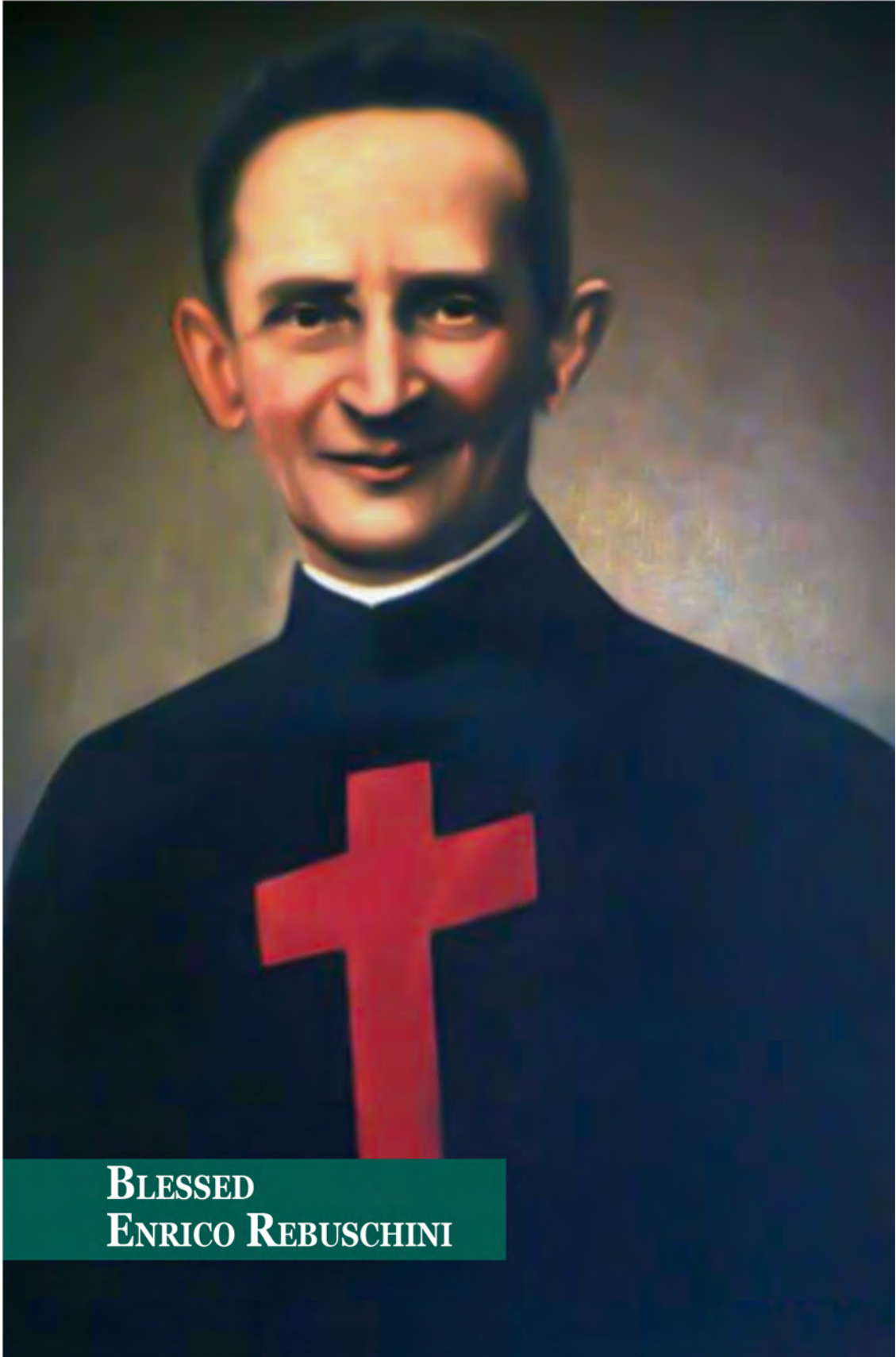
BLESSED ENRICO REBUSCHINI