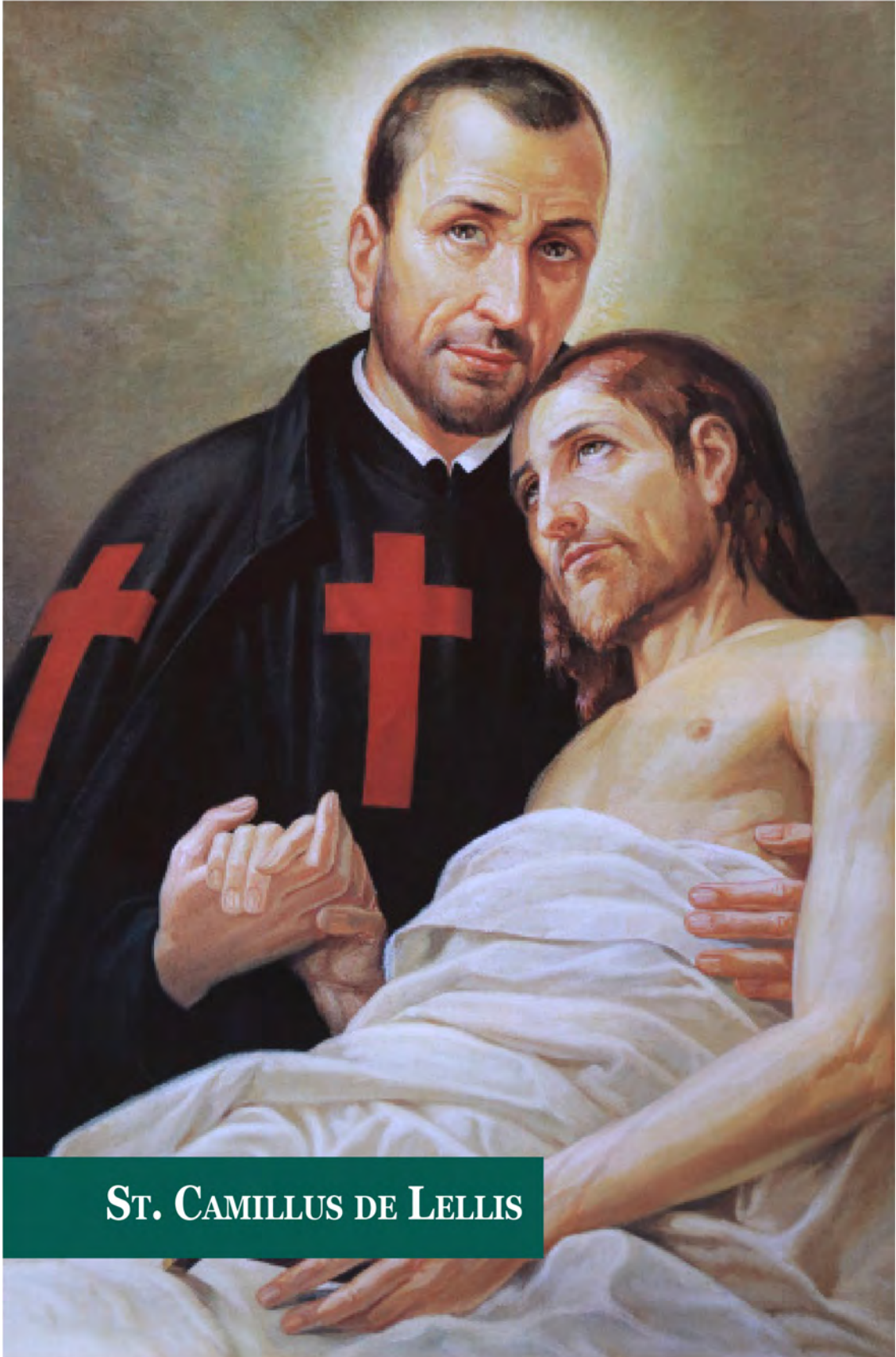
ST. CAMILLUS DE LELLIS