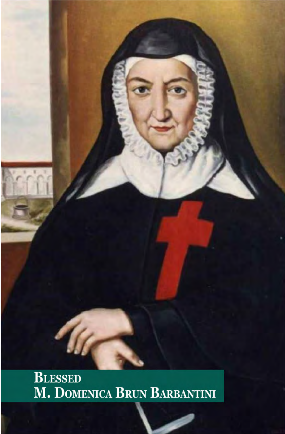
BLESSED M. DOMENICA BRUN BARBANTINI