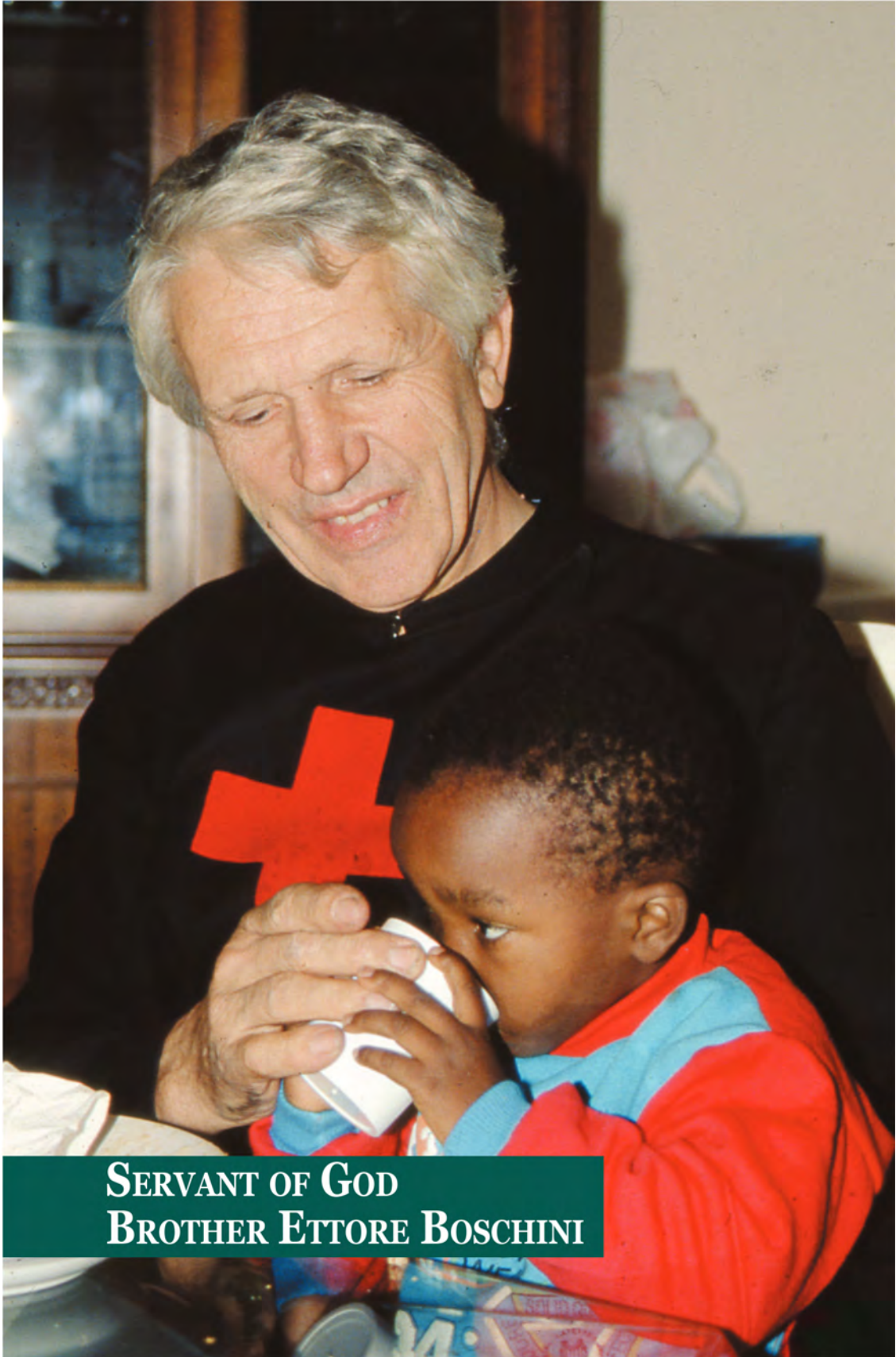
SERVANT OF GOD BROTHER ETTORE BOSCHINI