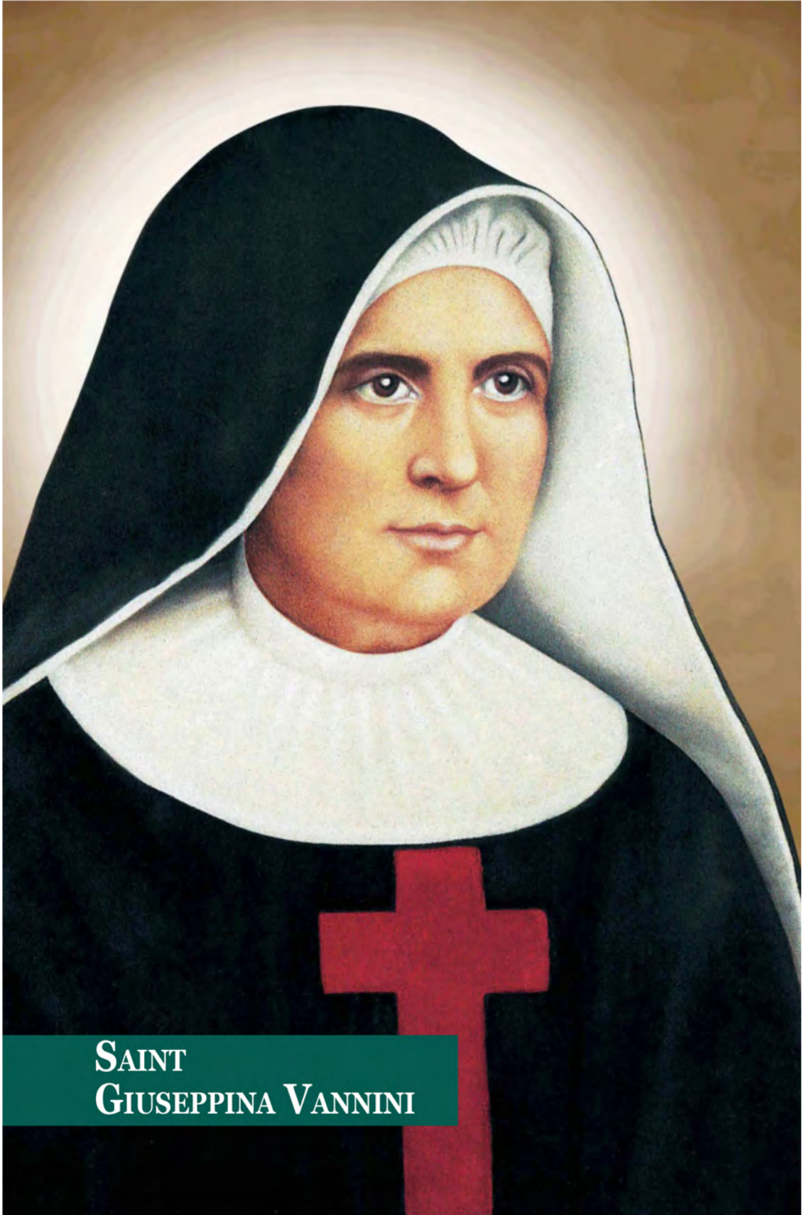
SAINT GIUSEPPINA VANNINI