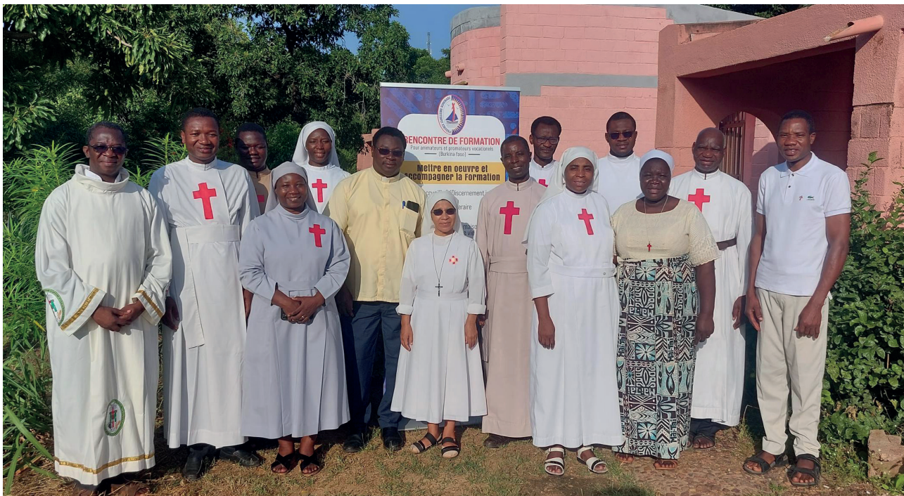
Formators and vocation promoters of the Camillian charismatic family in French-speaking Africa

disappoint and that good sprouts even in the most fragile places.