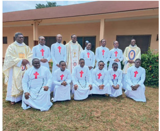
The new professed members of the Benin-Togo Province