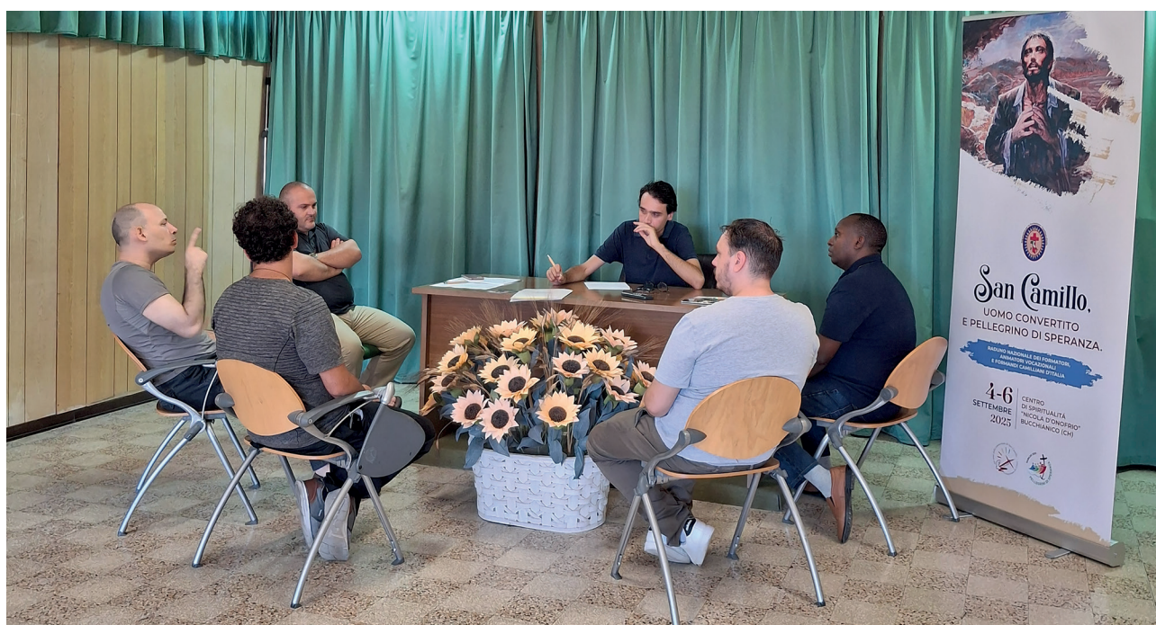
Fraternity in formation: young Camillians in Bucchianico