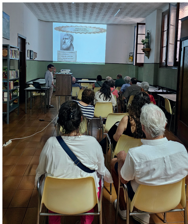
Informational meeting with the volunteers

The Listening Center is a private, free, and accessible space where people can express themselves freely, without judgment or prejudice. Unlike a professional therapeutic service, its mission is not to provide diagnoses or psychological treatments, but to offer active listening, understanding, and human accompaniment. Volunteers, trained in empathic communication and emotional support techniques, learn to be present, to welcome the silences and emotions of others, and to foster a process of reconnection with their inner resources.