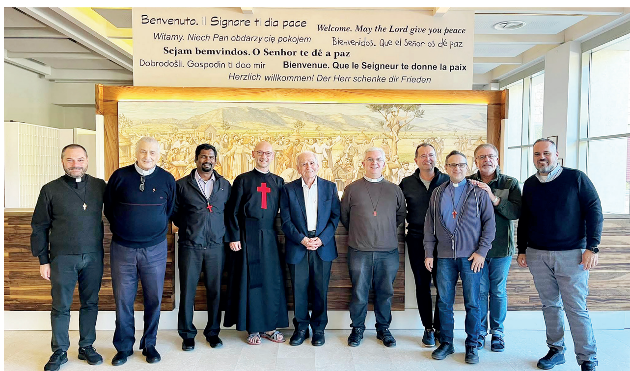
The Camillian religious present at the conference

The 60th Conference of A.I.Pa.S., the Italian Association of Pastoral Care in Health, was held in Assisi, at the Basilica of Santa Maria degli Angeli, from October 6 to 9, 2025, with the theme “Living Hope Together on the Threshold of Pain. Rom 5:5.”