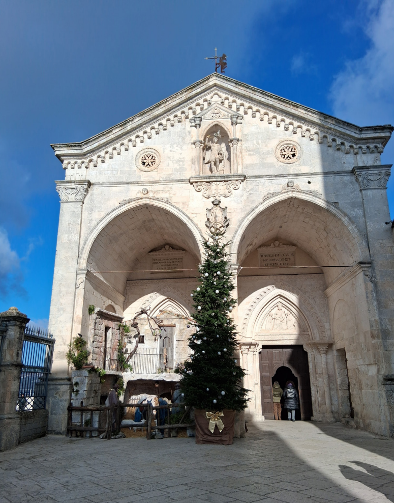
Chiesa di San Domenico, dove S. Camillo chiese l'elemosina

arms represents both a COVID patient, due to the presence of a surgical mask resting on one leg, and Christ.