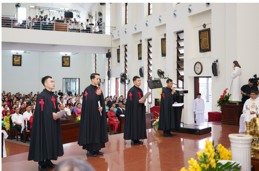
Solemn profession celebrated in Vietnam