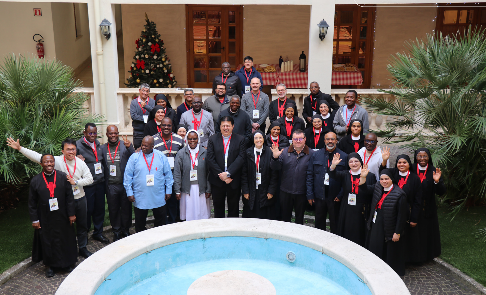
Participants in the international conference of jubilarians