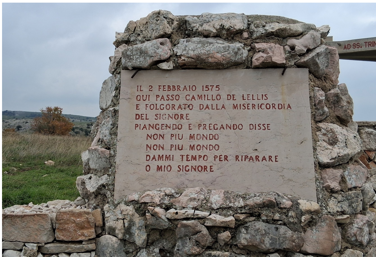
The site of the conversion of St. Camillus, Valle dell'Inferno