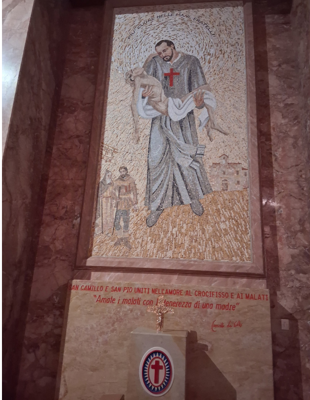
The mosaic depicting St. Camillus, in the shrine at San Giovanni Rotondo